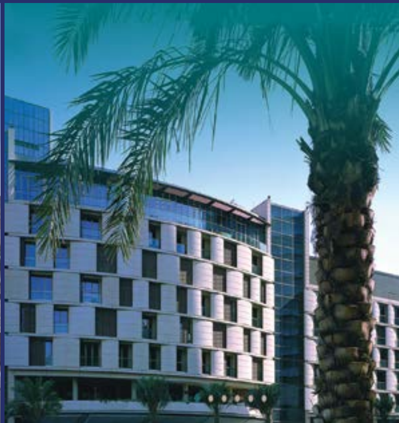
ALFAISALIAH HOTEL RIYADH - KSA APRIL 15 - 18