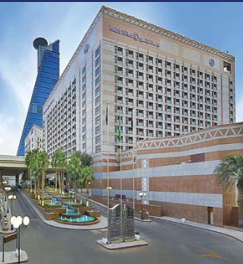
HILTON HOTEL JEDDAH - KSA April 8 - 11