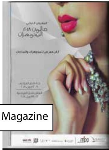
Alam Arrajol Magazine