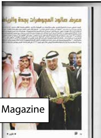
Alam Arrajol Magazine